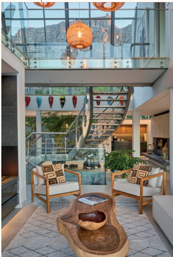
Atzaró Cape Town