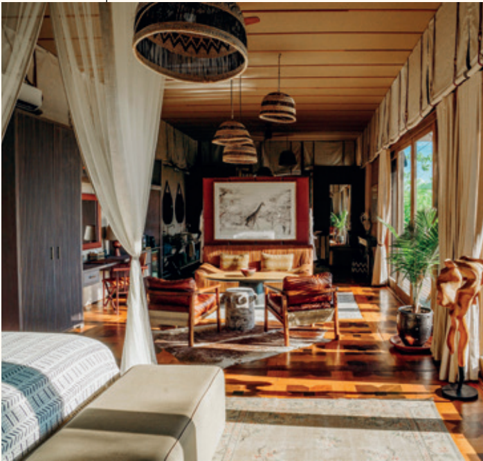
Atzaró Okavango Camp

With just eight stand-alone suites, a family suite, and a villa, the camp combines safari elegance with an intimate connection to nature.