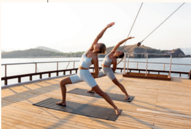
Prana by Atzaró

Beyond your suite, discover expansive lounges, sun-drenched decks, and shaded daybeds perfect for relaxation. The rooftop transforms from a yoga sanctuary at sunrise to an open-air cinema by night, while the spa invites you to indulge in treatments with the ocean as your backdrop.