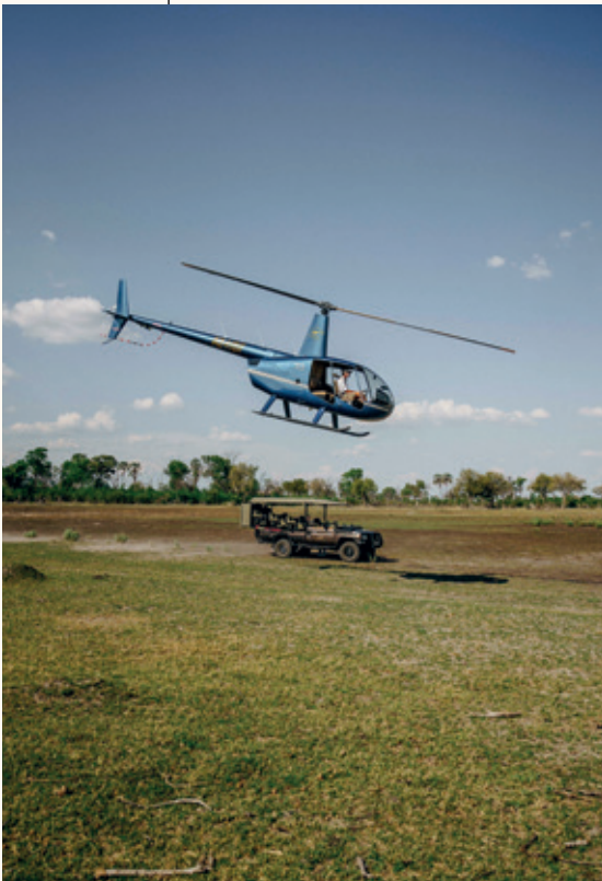
Atzaró Okavango Camp

Your Okavango adventure spans land, water, and sky. Explore via twice-daily game drives, mokoro canoe trips, walking safaris, and helicopter flights; all led by expert local guides with decades of experience navigating the Delta's living, breathing ecosystem.