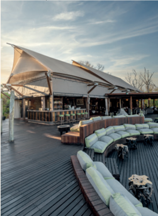
Atzaró Okavango Camp