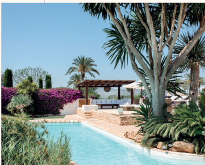
Atzaró Agroturismo Hotel

As the flagship of the Atzaró Collection , this serene rural retreat features 24 elegant suites, multiple pools, a farm-to-table restaurant, an organic vegetable garden, a world-class spa, and a profound connection to nature and local heritage.