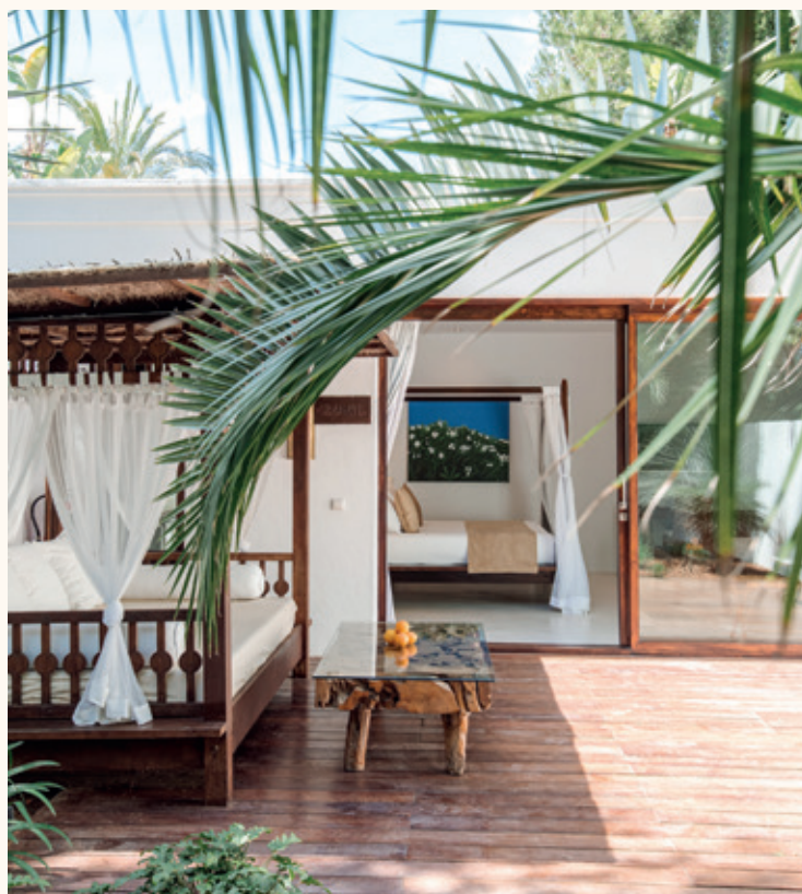
Atzaró Agroturismo Hotel